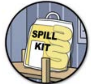
Use spill kit when required