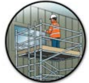
Working at height (use equipment supplied)