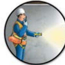
There is adequate lighting