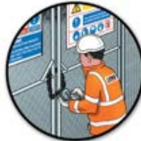
Prevent unauthorised access