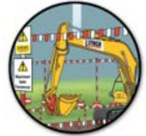
Be aware of height restrictions