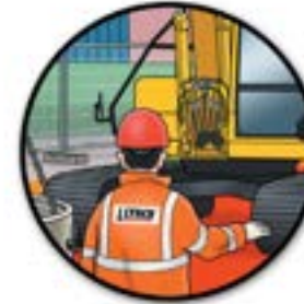
Keep a safe distance