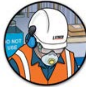
Always use the correct PPE