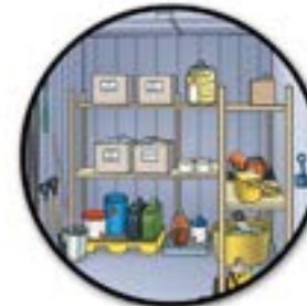
Keep storeroom tidy