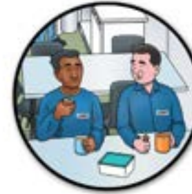
Use welfare facilities