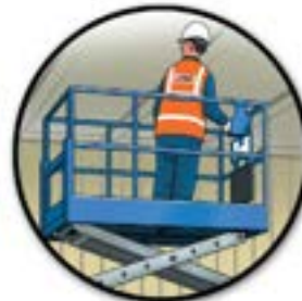
Only use MEWP if trained to do so