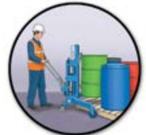
Use right equipment to lift heavy goods