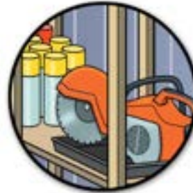
Store equipment safely